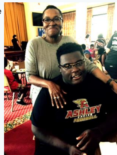
One of the proud Grandmas in the Grandparent Support Network with her graduate.